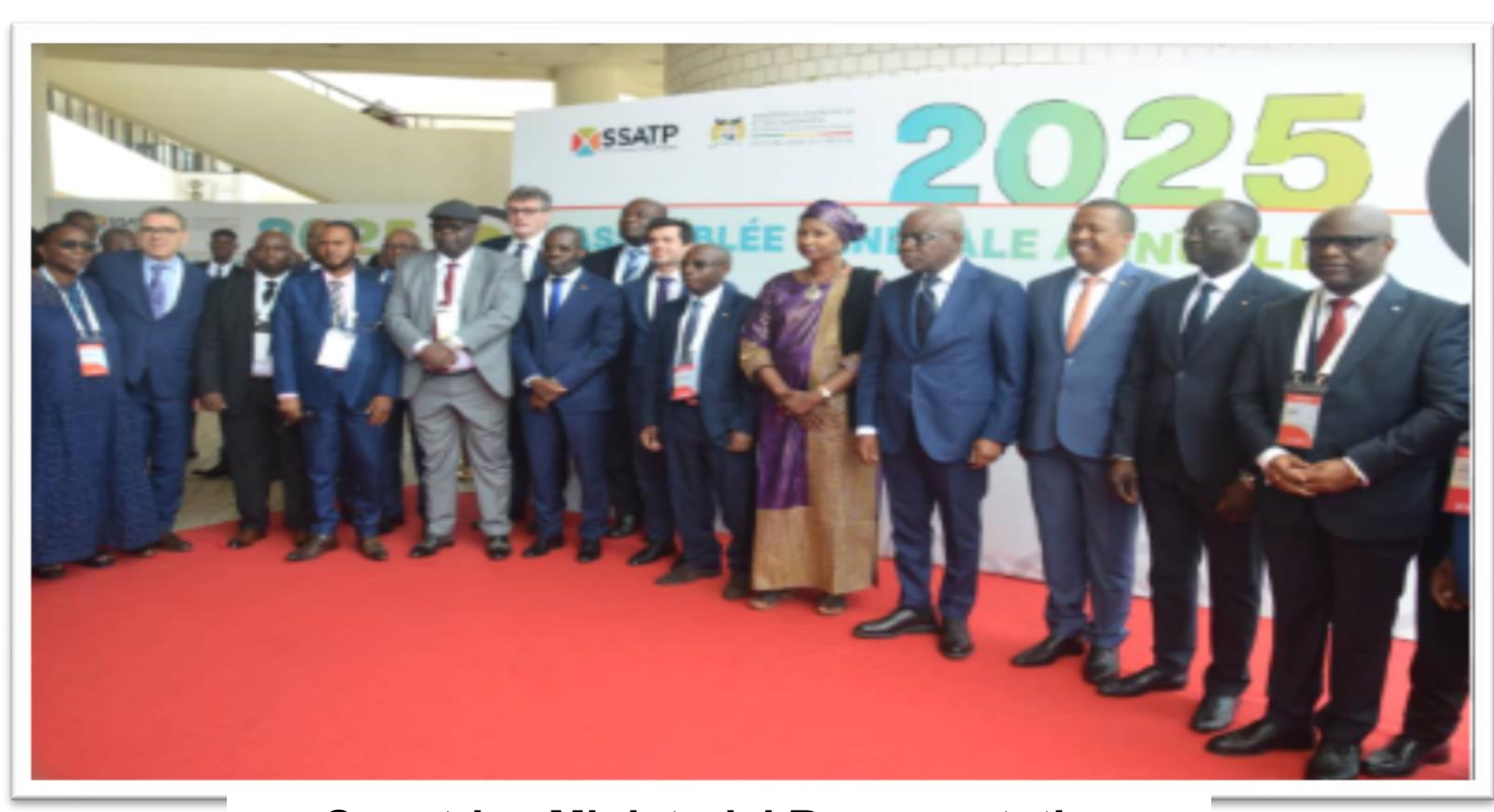
Countries Ministerial Representative photoshoot at the SSATP